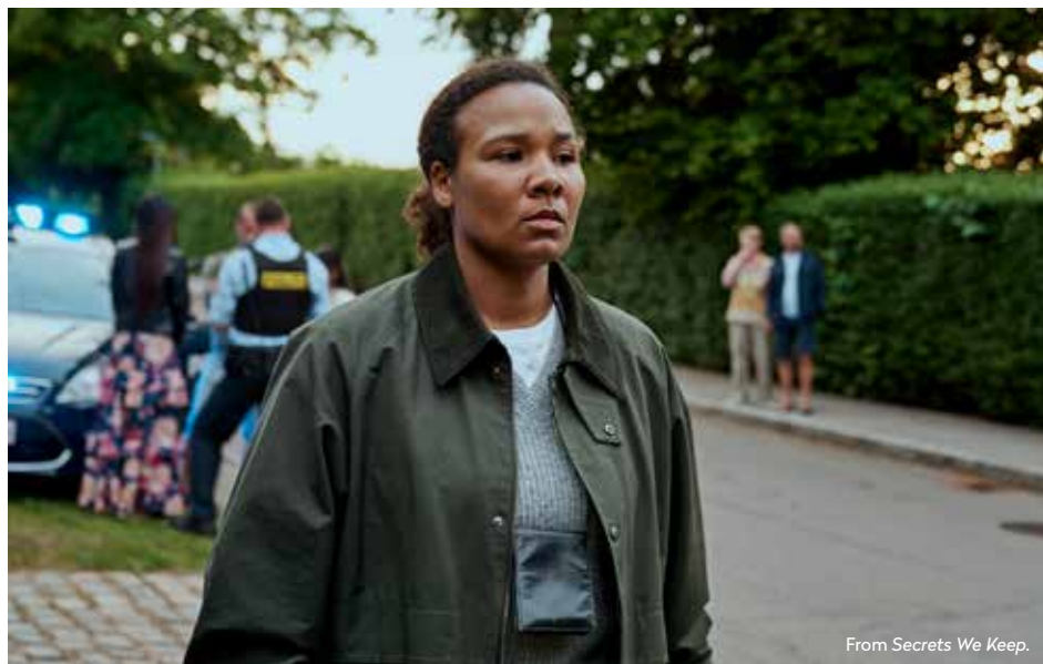
From Secrets We Keep.

Access with Nordic Film Market and TV Drama Vision badges.