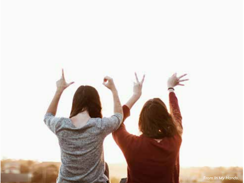
From In My Hands .