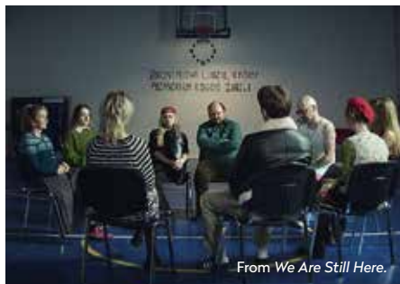
From We Are Still Here.