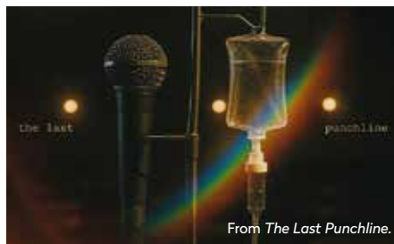
From The Last Punchline.