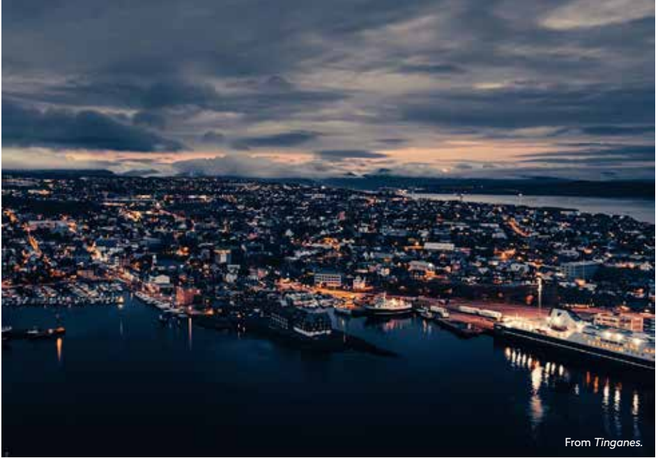
From Tinganes .