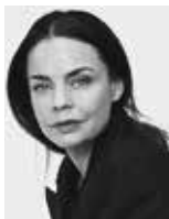
Agnes Kittelsen Actor Norway