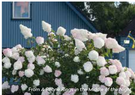
From A Phone Rings in the Middle of the Night